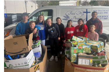
Queen of All Saints students

We are very thankful to all our supports for their effort and donation. If you are interested in organizing a food drive, please contact Scarlet at scarletm@fmpstl.org