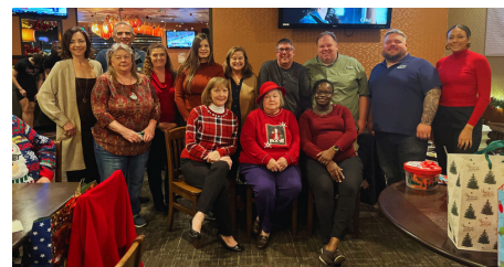
Staff at Holiday Party