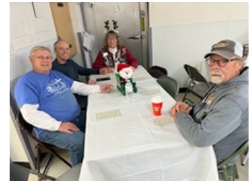
Volunteers at holiday party

To thank our volunteers, we ended the year with holiday parties at each site! Feed My People volunteers dedicate their time and talents to help us fight hunger. We are grateful for their support.