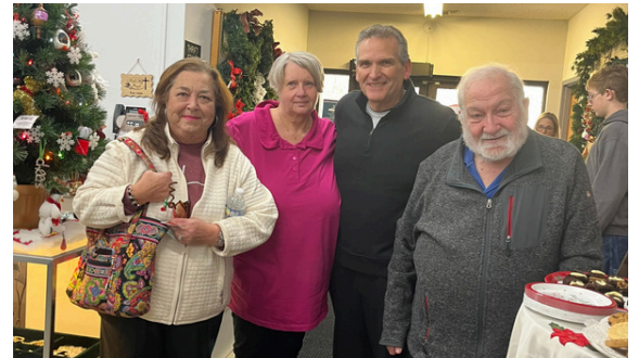
All above pictures show attendees at Holiday Shopping Kickoff