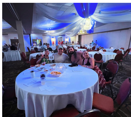
Guests at the Chef's Challenge

Thank you to our participating chefs, attendees, and sponsors. We hope to see you all again at the next Chef's Challenge and our upcoming events.