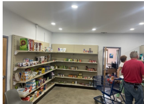
Shoppers getting groceries

As you all know, our Lemay location successfully became a client choice food pantry last Fall. Our second location at High Ridge is now also client choice! Both pantries can now empower and inspire our clients by letting them choose the food they want. They will work personally with a coach and receive one-on-one help to overcome challenges. This will enable our members to receive more holistic community services from Feed my People. By giving them the choice to choose, they have access to better nutrition. It encourages clients to become more independent and gain a sense of self-worth.