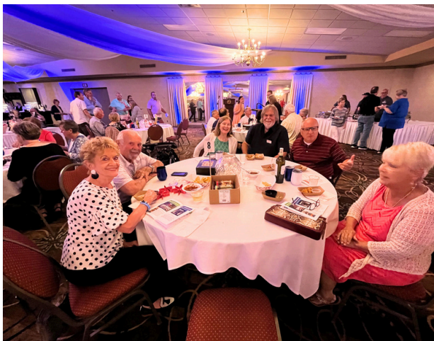
Guests at the Chef's Challenge

Happy Summer! We are so excited to share that our fan-favorite event, The Chef's Challenge, was a success! It's a friendly competition in which local chefs created delicious meals only using ingredients found in our food pantry. Guests were then able to sample each chef's dish and vote for their favorite.