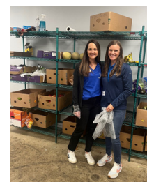
Novo Nordisk volunteers

If you are interested in volunteering at High Ridge or South County, contact Angela H. at (314)631-4900 x 315 or angelah@fmpstl.org . We'd love to have you!