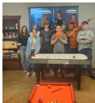
Youth group at church's rec room

A pastor's wife came into our thrift store, The Thrifty Hanger, to ask about a foosball table she saw outside for sale. She mentioned they were redecorating the youth group recreation room at church. Her husband was trying to provide a space for kids to socialize. We decided to donate the game table. A few weeks later, we received another game table and reached out to the pastor and his wife to see if they were interested in adding it to their rec room. They said yes and immediately came to pick it up! As you can see in the images below, the recreation room provides a safe space for youth to have fun and make friends!