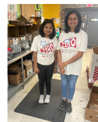
Maryville University volunteers