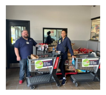
Staff helping for Shop Out Hunger