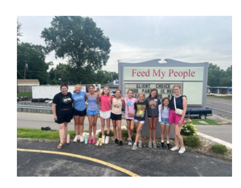
All above pictures are volunteers from FMP and YouthWorks