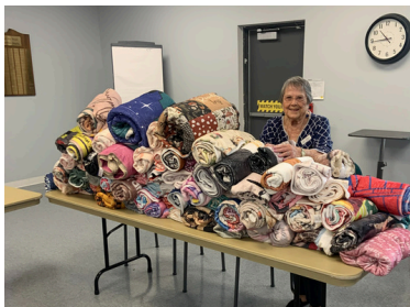
Image: Volunteer sorting over 100 blankets donated by Urban Feed