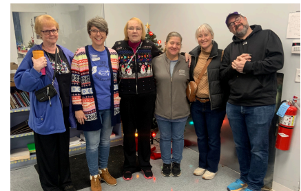
Volunteers at FMP

April is National Volunteer Appreciation Month! Feed My People volunteers are the reason we are able to serve over 1,600 individuals weekly. Their energy, talents, and time ensures we can support the community. We are truly blessed with the best volunteers around.